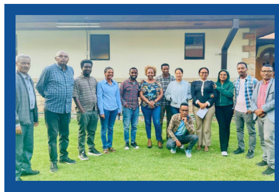
Picture: Ethiopia Youth Ministry Class, taught by one of our MA graduates at Evangelical Theological College, Addis Ababa.

Please continue to pray for these ministry efforts.